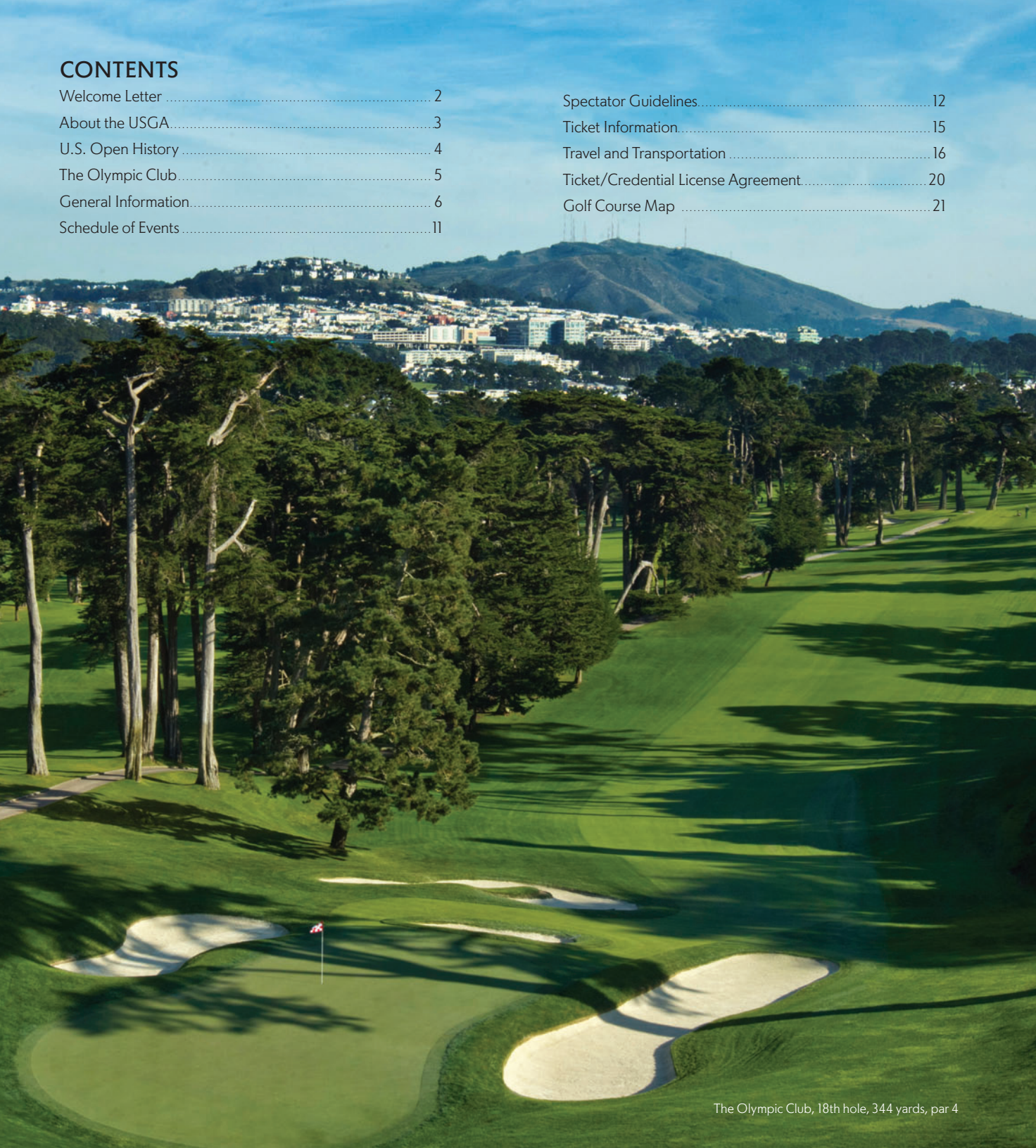
The Olympic Club, 18th hole, 344 yards, par 4