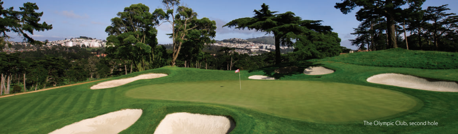
The Olympic Club, second hole