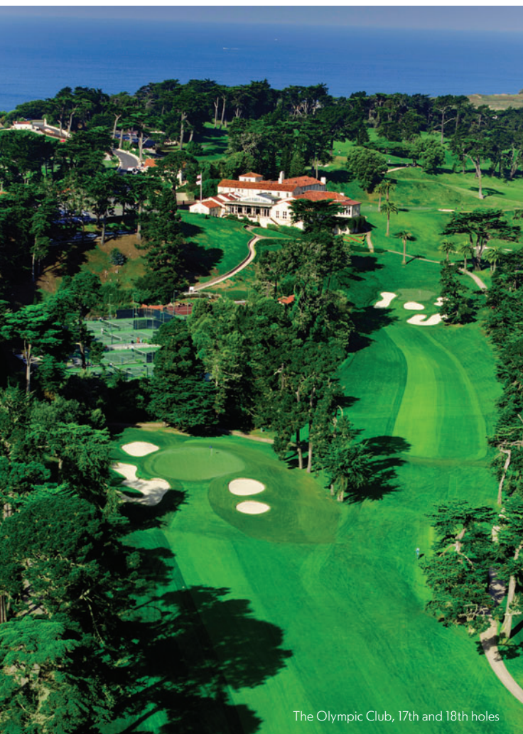
The Olympic Club, 17th and 18th holes

June 11–17 (Monday through Sunday) 6 a.m. to 7 p.m.