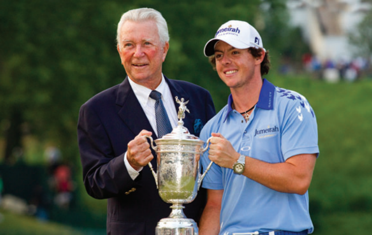
Ken Venturi and Rory McIlroy, left to right, with the trophy after the final round at the 2011 U.S. Open at Congressional Country Club in Bethesda, Md. on Sunday, June 19, 2011.