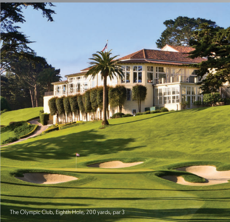
The Olympic Club, Eighth Hole, 200 yards, par 3